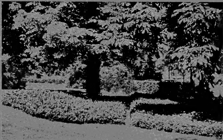
This photo shows a 2 year old planting of Lily of the Valley and Baltic Ivy on the left. This particular area is in full sunshine most of the day. On the right side is Pachysandra. The amount of moisture in this area is below normal but it shows how well these plants can do, once established.

(Sold out until September 1, 1958. The demand for this plant has left us sold out until that time when new vigorous stock will be ready. You can order anytime in advance for shipment in the fall.)